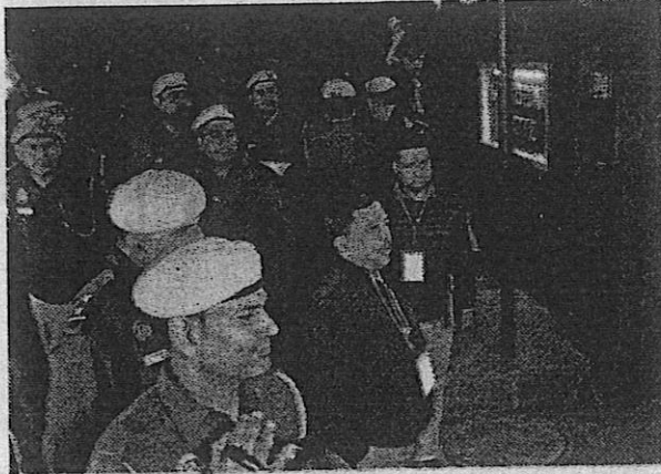
Police personnel outside Punjab chief minister Bhagwant Mann's Kapurthala House residence in New Delhi on Thursday.

AAP national convenor Arvind Kejriwal questioned the 'selective targeting of the Opposition leaders', highlighting that