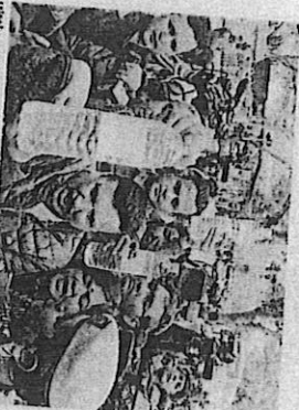
Hitting out at BJP leader Sanjay Singh carrying 'contaminated' water samples to the BJP headquarters in New Delhi on Thursday.

Mr. Kejriwal said he knew he would be jailed in two days but was "not