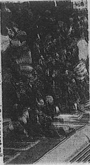
Rush of passengers at the Varanasi Cantonment railway station on mauni amavasya in Varanasi late on Wednesday.

Mr. Rijju described the meeting chaired by defence minister Rajnath Singh as "constructive" and sought cooperation from all Opposition parties, adding that the customary discussions on the President's address to Parliament and the Union budget were the main priorities in the budget session. BJP ally Janata Dal (United) has sought an extension in the tenure of the Joint Parliamentary Committee scrutinising the bills proposing simultaneous elections. P8