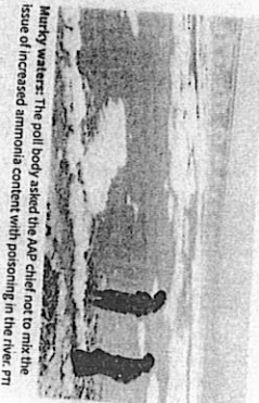
Murky waters: The poll body asked the AAP chief not to mix the issue of increased ammonia content with poisoning in the river.