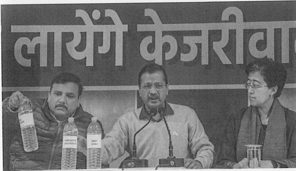
AAP national convener Arvind Kejriwal with Delhi CM Atishi and Rajya Sabha MP Sanjay Singh during a press conference, in New Delhi, on January 30, 2025.