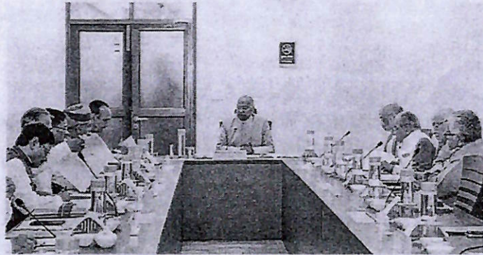
Ramnath Kovind chairs a meeting of the high-level committee on ONOE

The panel has convened two meetings so far, and the third meeting is expected to see fireworks as, for the first time, legal experts are deposing before it. Opposition parties have op-